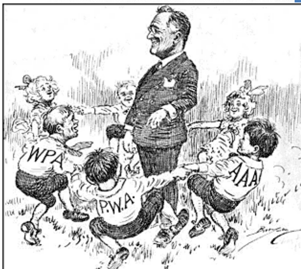
Political cartoon from 1934, FDR and the "alphabet soup" agencies.

"Scuse me, Buddy, is this the bread-line or a run on a bank?"